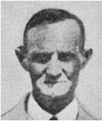
Henry Holland priest

THE 1942 MARTYRS came from PNG, England and Australia, and were killed during the Japanese invasion of PNG. They were among over 300 Anglicans, Roman Catholics, Lutherans and other church workers who lost their lives: